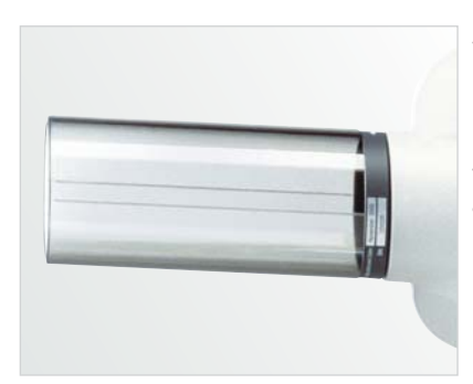
31 cm (12") long cone, rotates through 395°.

X-Mind generators are fitted with long cones recommended for the parallel technique. A short cone for the bisector technique or a rectangular cone that reduces the rays applied to the patient's skin by 50%, are available as options.