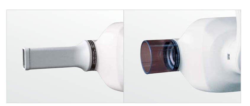
Rectangular cone (44 x 35 mm).